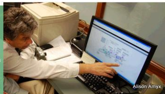
Power Wise: First Presbyterian Church of Atlanta receives an Energy Audit